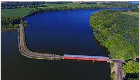
Langley Covered Bridge, north of Centreville, MI.