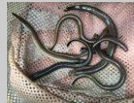
Larval lampreys collected from Turkey Creek, south of Goshen, in 2018

With all the lampreys swimming around in our local waterways, should we be concerned about lampreys sticking to us? Absolutely not! They do not like how people taste!